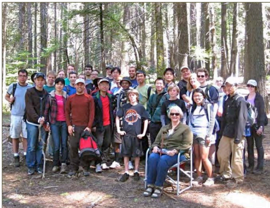
In Centennial Grove