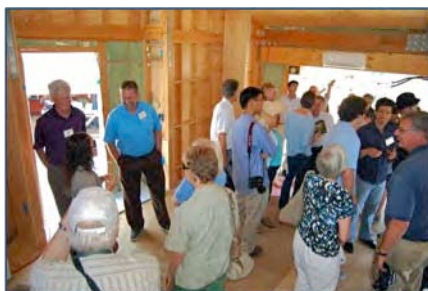
Viewing CHIP on Y Friends Field Trip