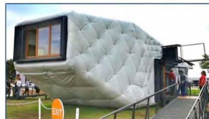
CHIP reassembled in DC