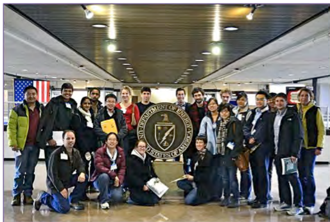
At the Department of Energy

All in all, not only did we learn a lot about the policy world from the discussion sessions with prominent personnel, but we also learned much about the culture of Washington DC. We were able to explore the museums, the Memorials, the White House, and downtown DC. It was an eventful trip.