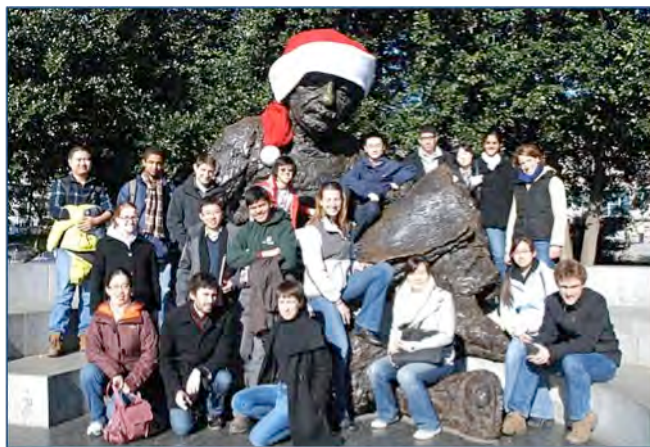
At the Einstein Memorial